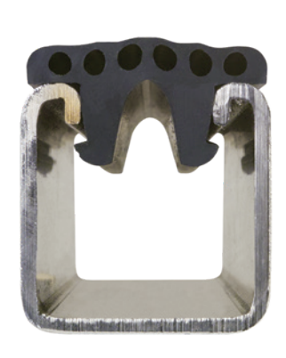
Installs simply by pushing into place