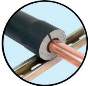
2 Put in place and glue to insulation.