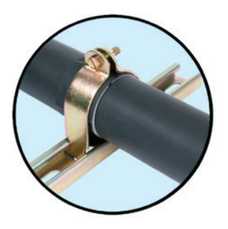
3. Wrap and seal with ProTape.